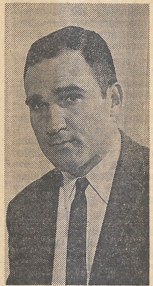
HOWARD HURT ... ex-Duke star ...

Hurt was selected from seven or eight candidates.